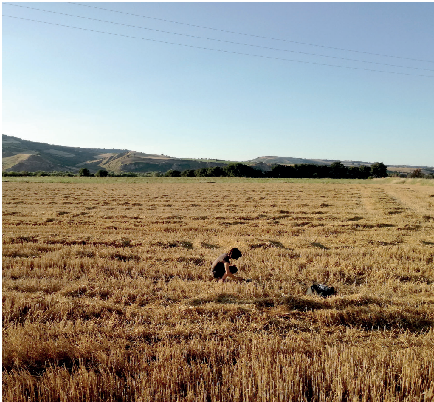
Wheat field (Southern Italy)