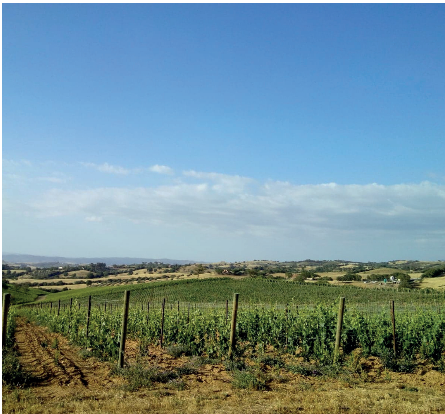
Vineyard (Tuscany, Central Italy)