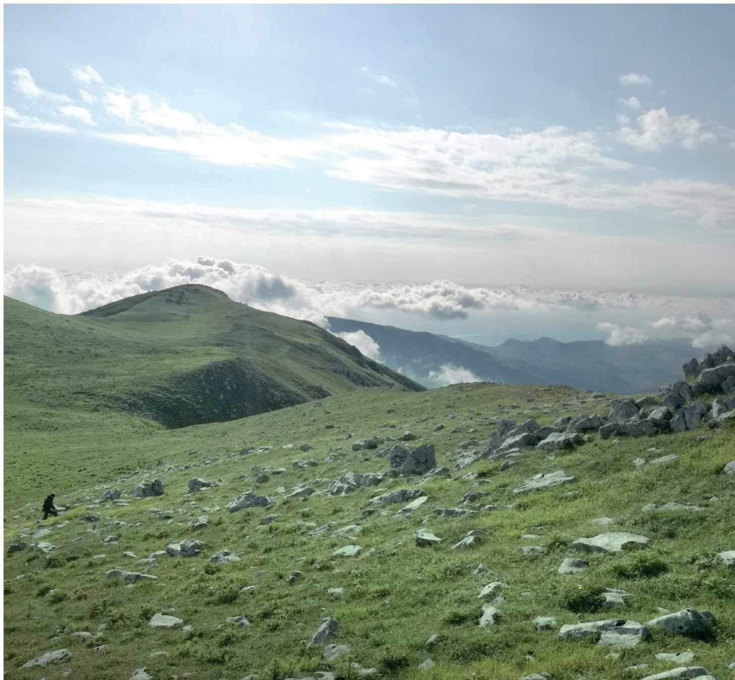
Matese Mts (Southern Apennines, Italy)