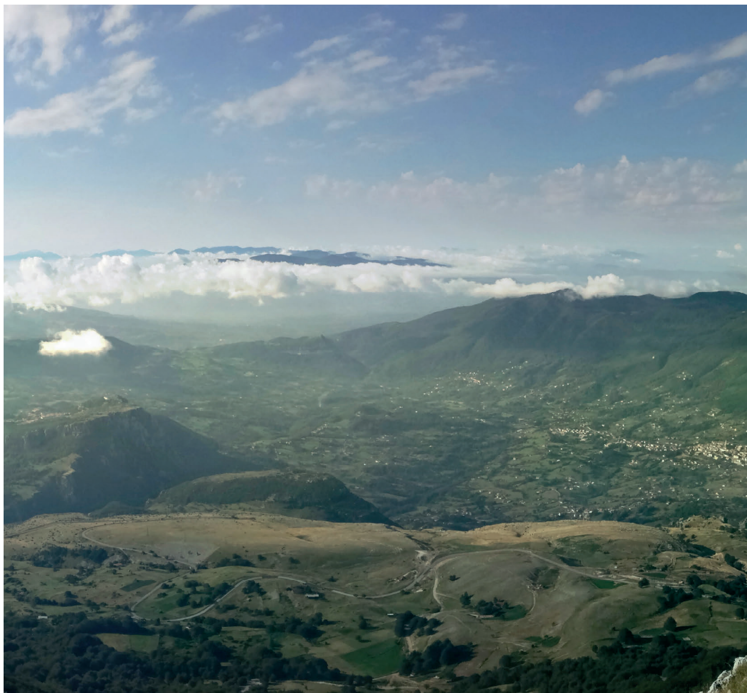
View from Mt. Mutria (Southern Apennines, Italy)